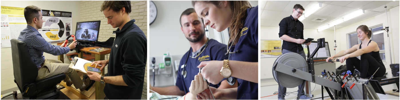
Students at the undergraduate and graduate levels actively engaged in the many research projects led by the Faculty of Health.