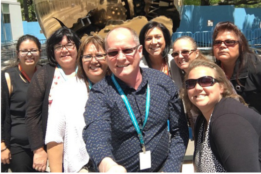
Master in Indigenous Relations students and faculty outside the UN.