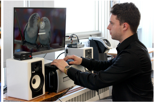
Research that supports the professional development and entrepreneurial activities of our students.